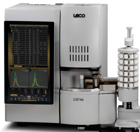
CS744 with optional autoloader