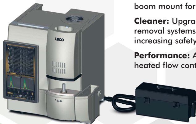
CS744 with high-velocity vacuum system

Performance Sulfur: Upgrades the standard flow controller with a thermally stabilized flow controller for improved baseline stability and precision