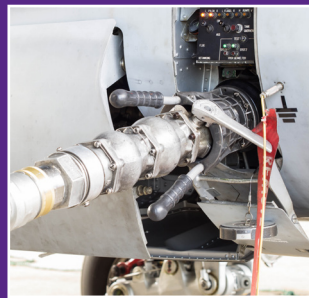
FAME in Jet-Fuel