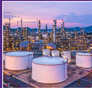
FAME in Diesel