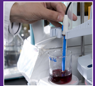
Quality Control Laboratory