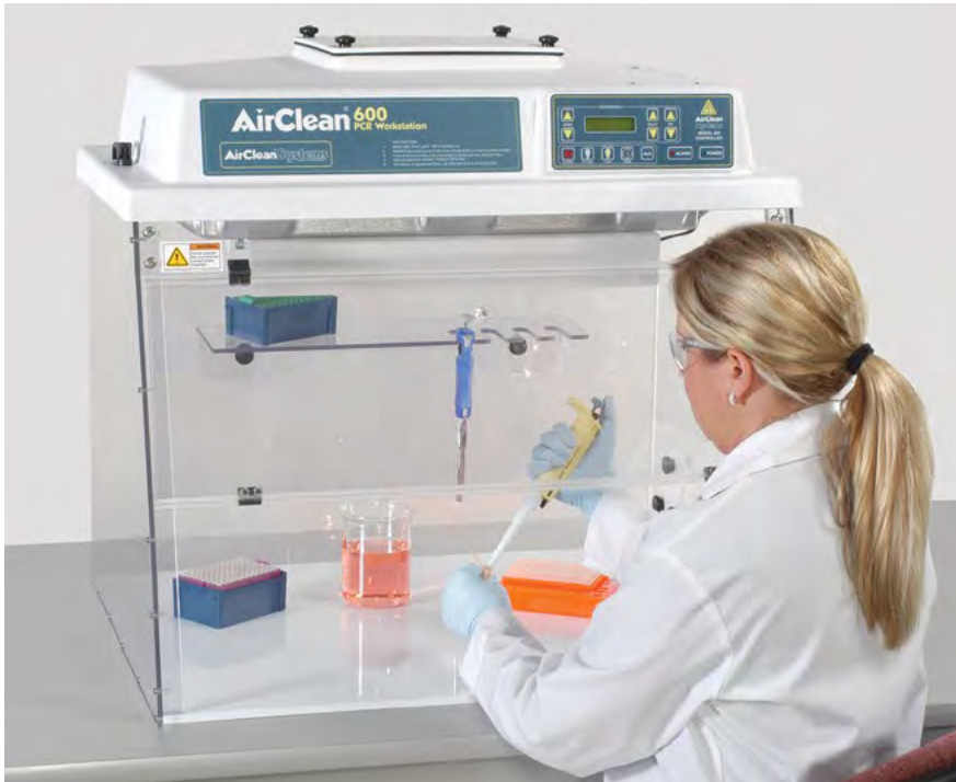
AC632LFUVC PCR Workstation in use