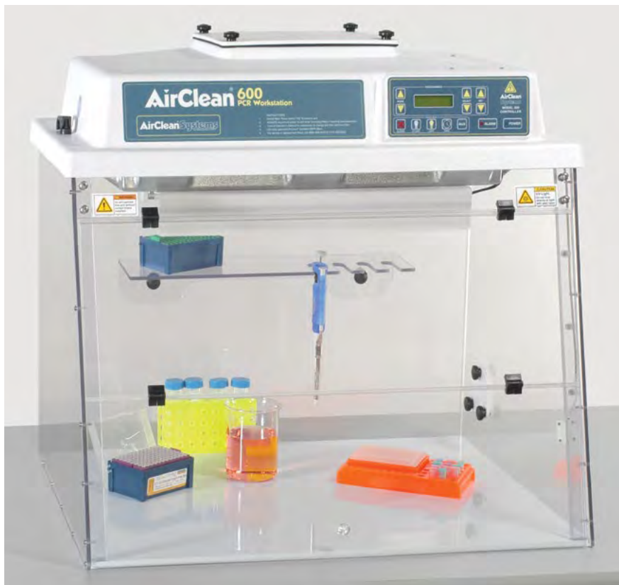
AC632LFUVC PCR Workstation

AirClean® Systems AC600 Series PCR Workstations combine ISO 5 HEPA-filtered air with UV light irradiation for the ultimate DNA/RNA manipulation and amplification work area. Cross-contamination during amplification of DNA and RNA can lead to results that are inaccurate, costing the lab technician valuable time and reagents. PCR Workstations minimize this risk by keeping airborne contaminants away from samples and irradiating work surfaces and tools between amplifications.