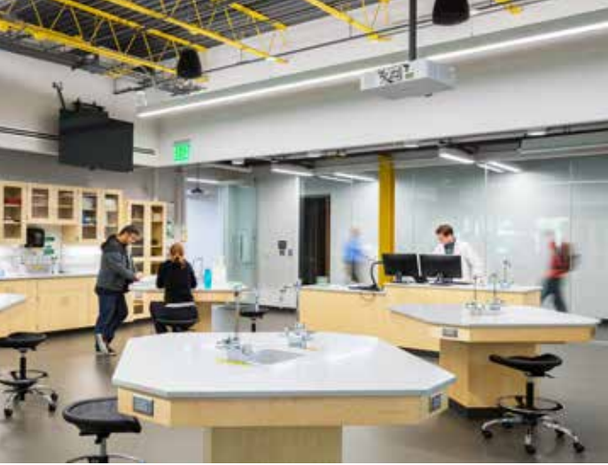
Grey Kemresin on octagonal student tables