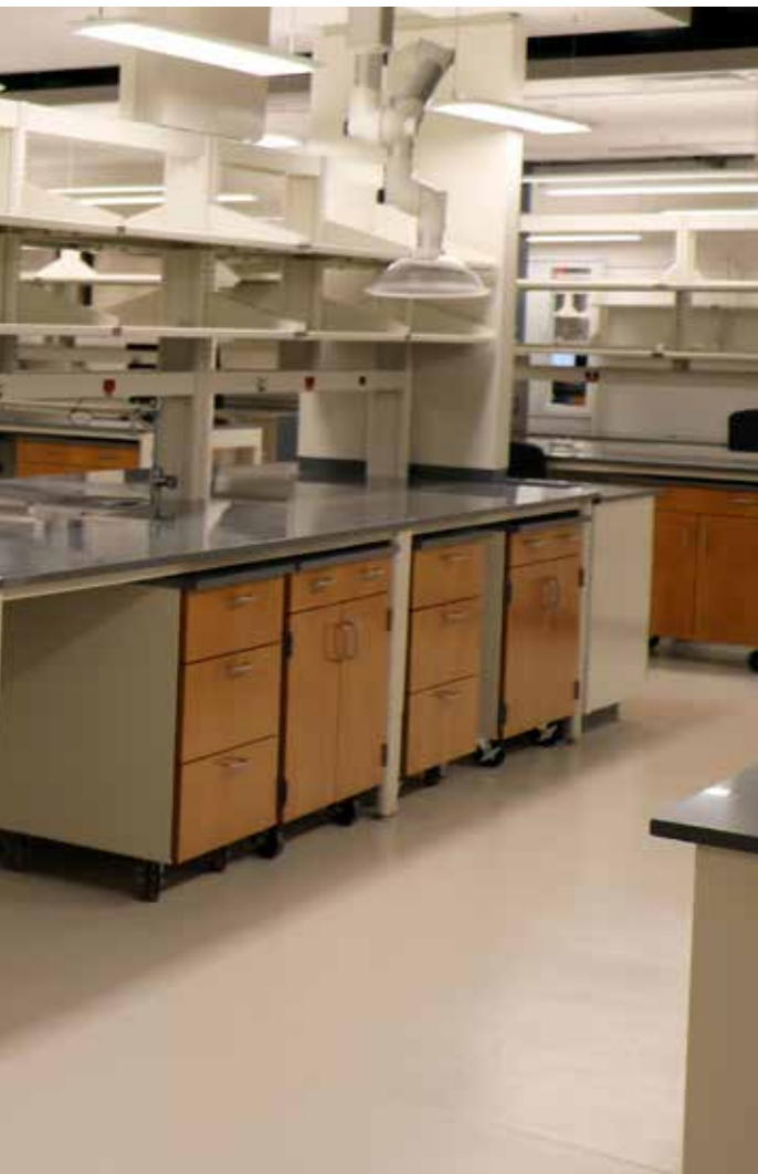
Black Kemresin on Enterprise workstations and steel casework

Available Colors: Black, Grey, Slate, Putty