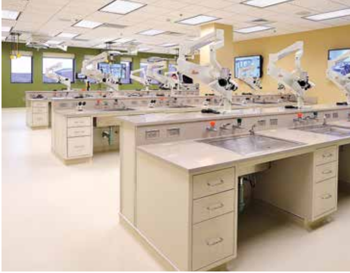
Putty Kemresin on steel, inset-square edge casework